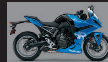
Metallic Triton Blue (YSF)