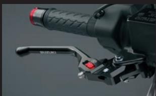
Billet Brake Lever (Anodized)