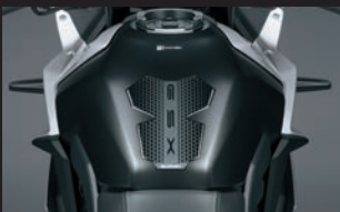
Fuel Tank Pad