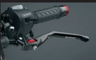
Billet Clutch Lever (Anodized)