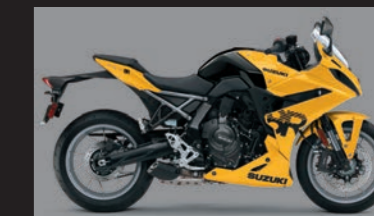
Pearl Ignite Yellow (QZY)