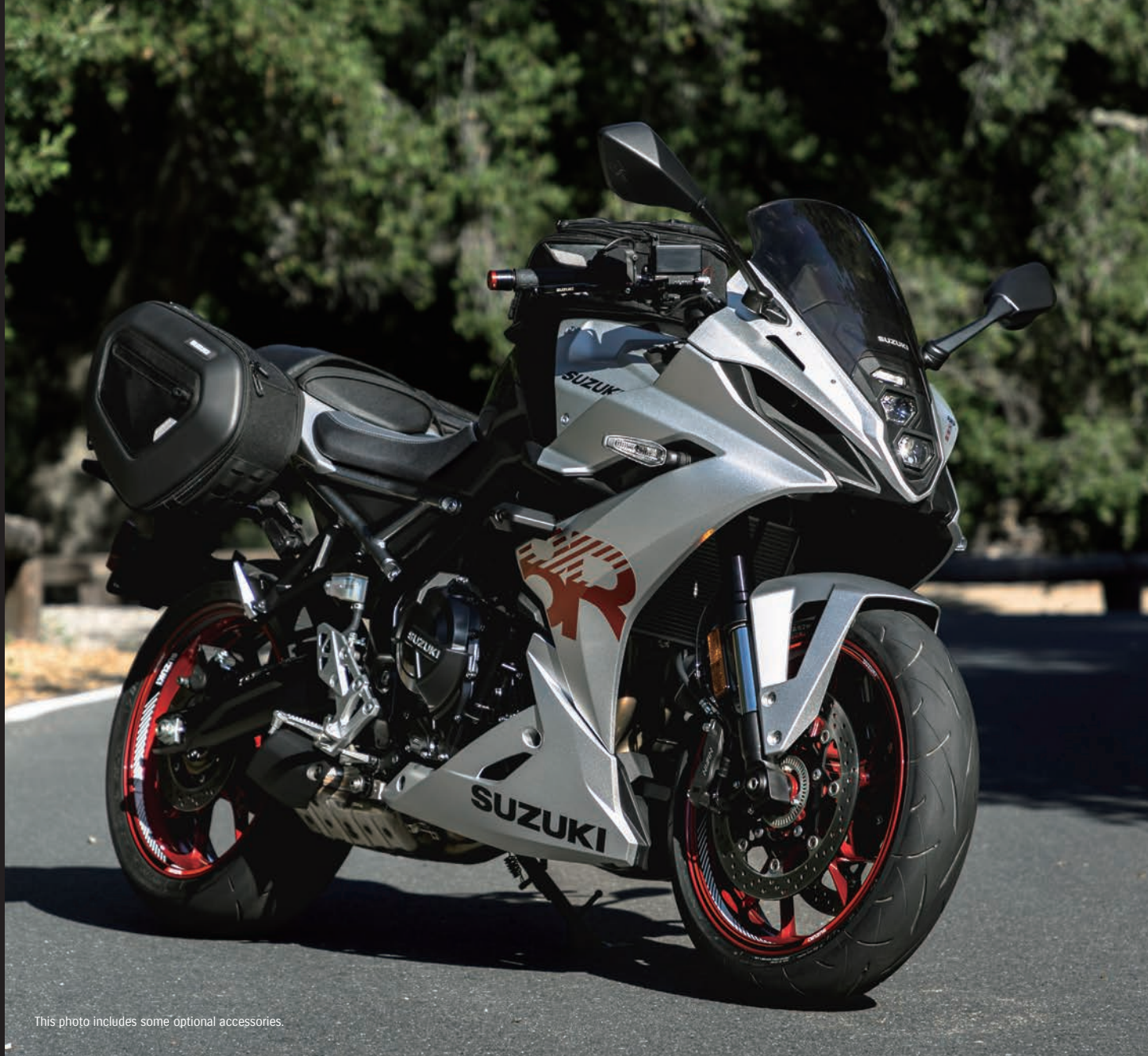
This photo includes some optional accessories.