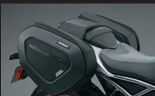
Soft Side Case Set