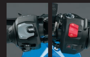
Left handlebar switch

The GSX-8R adopts a custom 5-inch color TFT LCD multifunction instrument panel. Clearly legible high-quality information displays keep you fully aware of all the bike's systems and settings, and supply vital real-time operating status information. The tachometer does double duty as a programmable rpm indicator that blinks when the engine reaches a preset speed, and the LCD now adds a function that lets you display large pop-up alerts and warnings. Manual or automatic settings for switching between the day (white) and night (black) display modes let you maximize visibility at any hour and in any riding situation.