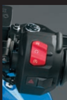
Right handlebar switch