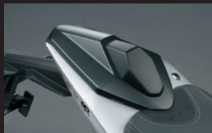
Single Seat Cowl