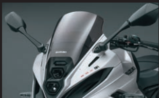
Touring Screen (Smoked Tint)