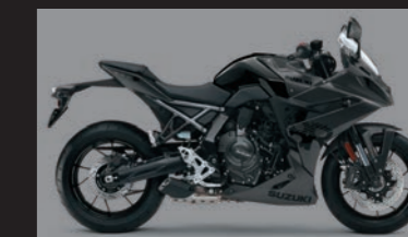
Metallic Mat Black No.2 (YKV)