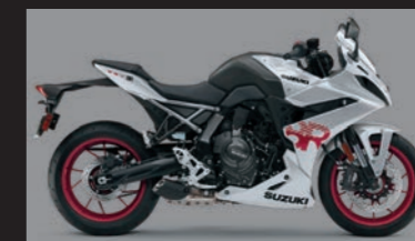
Metallic Mat Sword Silver (QKA)